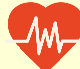
Having certain medical conditions