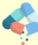
Taking certain medications