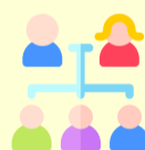
Having a family history of bone fractures

FACT Even if you drink plenty of milk and exercise, you may still be at risk of osteoporosis. There are many reasons why people get osteoporosis, including: