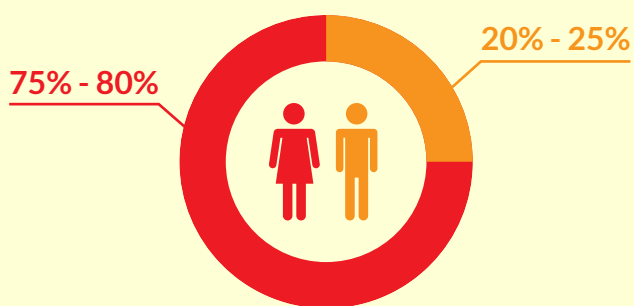
Incidences of hip fractures

FACT Although osteoporosis is more common in women, it has been increasingly diagnosed in men, who are more likely to suffer from disability and death from fractures which they typically develop at an older age. Osteoporotic fractures occur in one-third of women and one-fifth of men aged above 50.